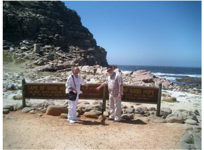
Original South Africans?