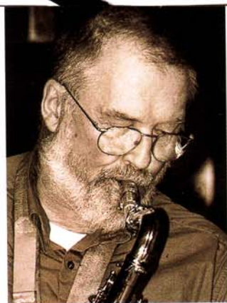
Jazz at the Carcosa Seri Negara.

This dinner show is priced at RM185nett per person. After KL performances, the group travels to Andaman Datai Bay in Langkawi for September 10 show. Tel: 2282 1888